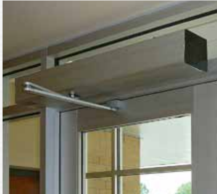
Single—side load lintel mounted header