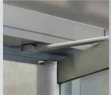
Low profile application—optional slim line cover