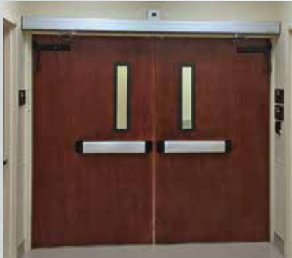
Pair—side load lintel mounted header