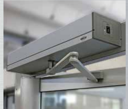
Low profile application—optional slim line cover