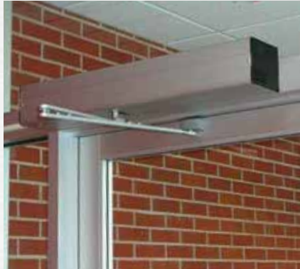
Single—side load lintel mounted header