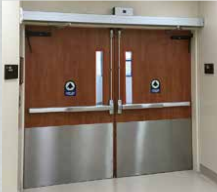
Pair—side load lintel mounted header